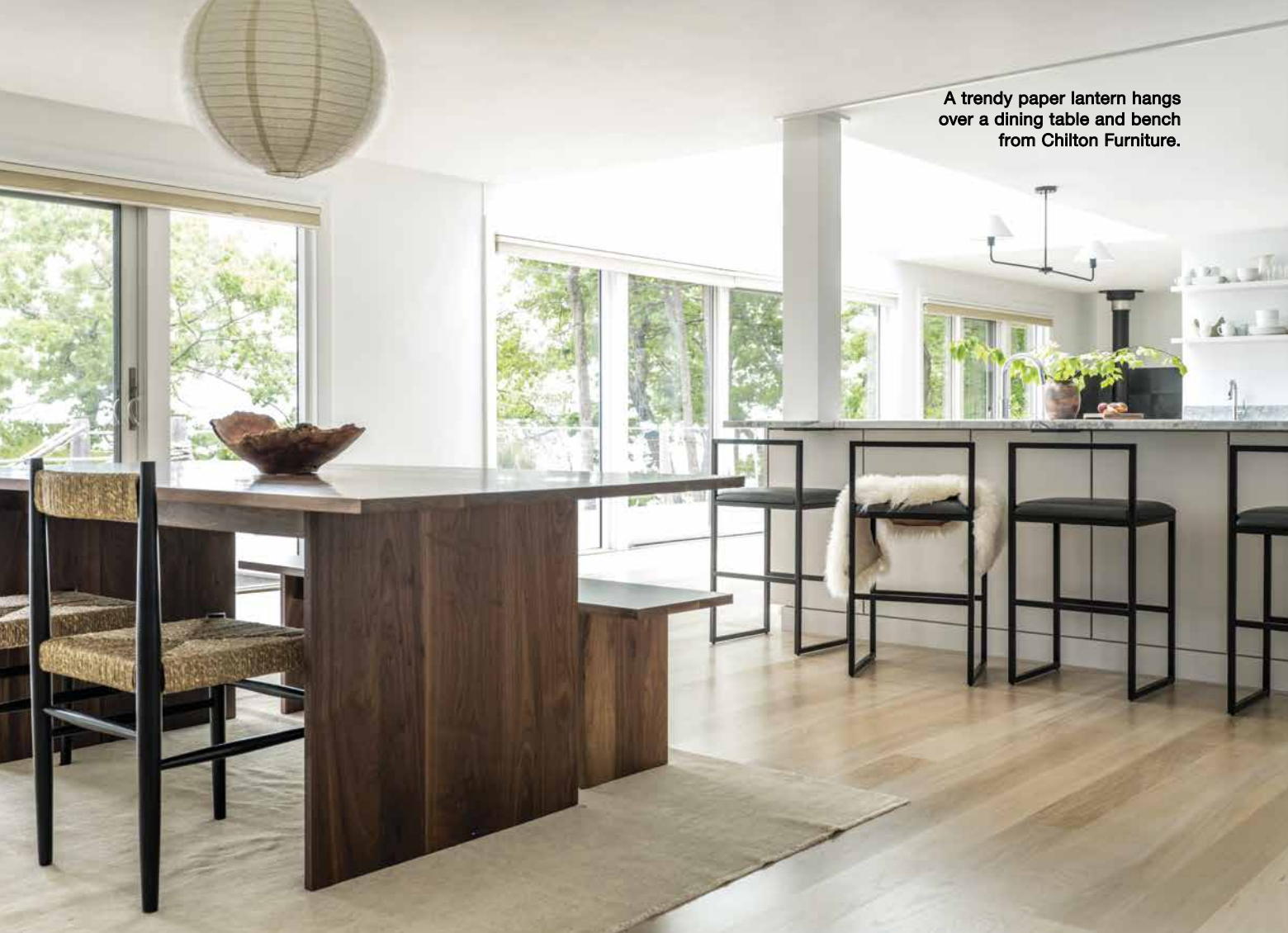
A trendy paper lantern hangs over a dining table and bench from Chilton Furniture.