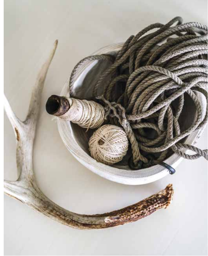
Art by Sarah Madeira Day pops against the white walls and cream bedding from Evangeline Linens. TOP, LEFT: A study in neutrals: An antler with twine and rope tucked within a textural vessel.