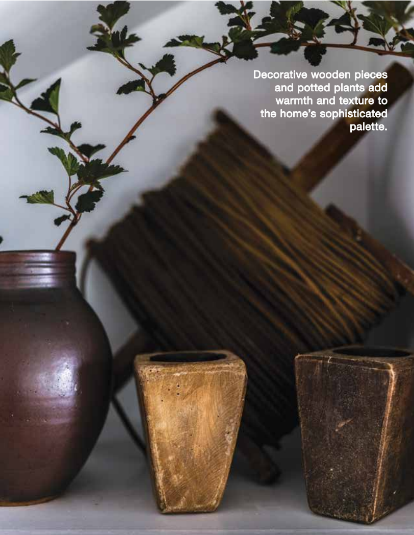
Decorative wooden pieces and potted plants add warmth and texture to the home's sophisticated palette.