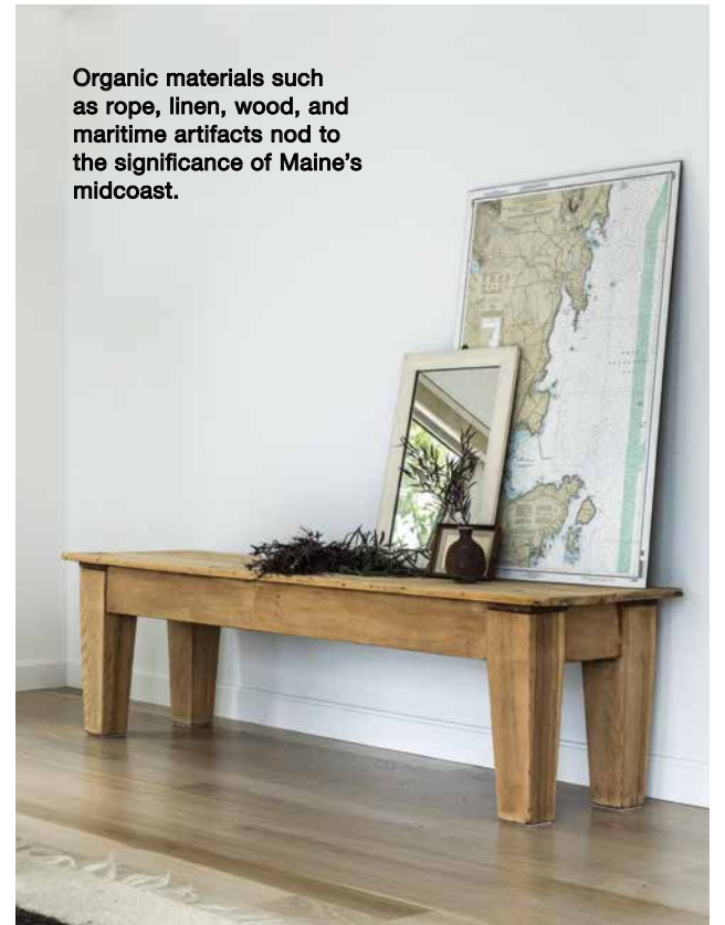
Organic materials such as rope, linen, wood, and maritime artifacts nod to the significance of Maine's midcoast.