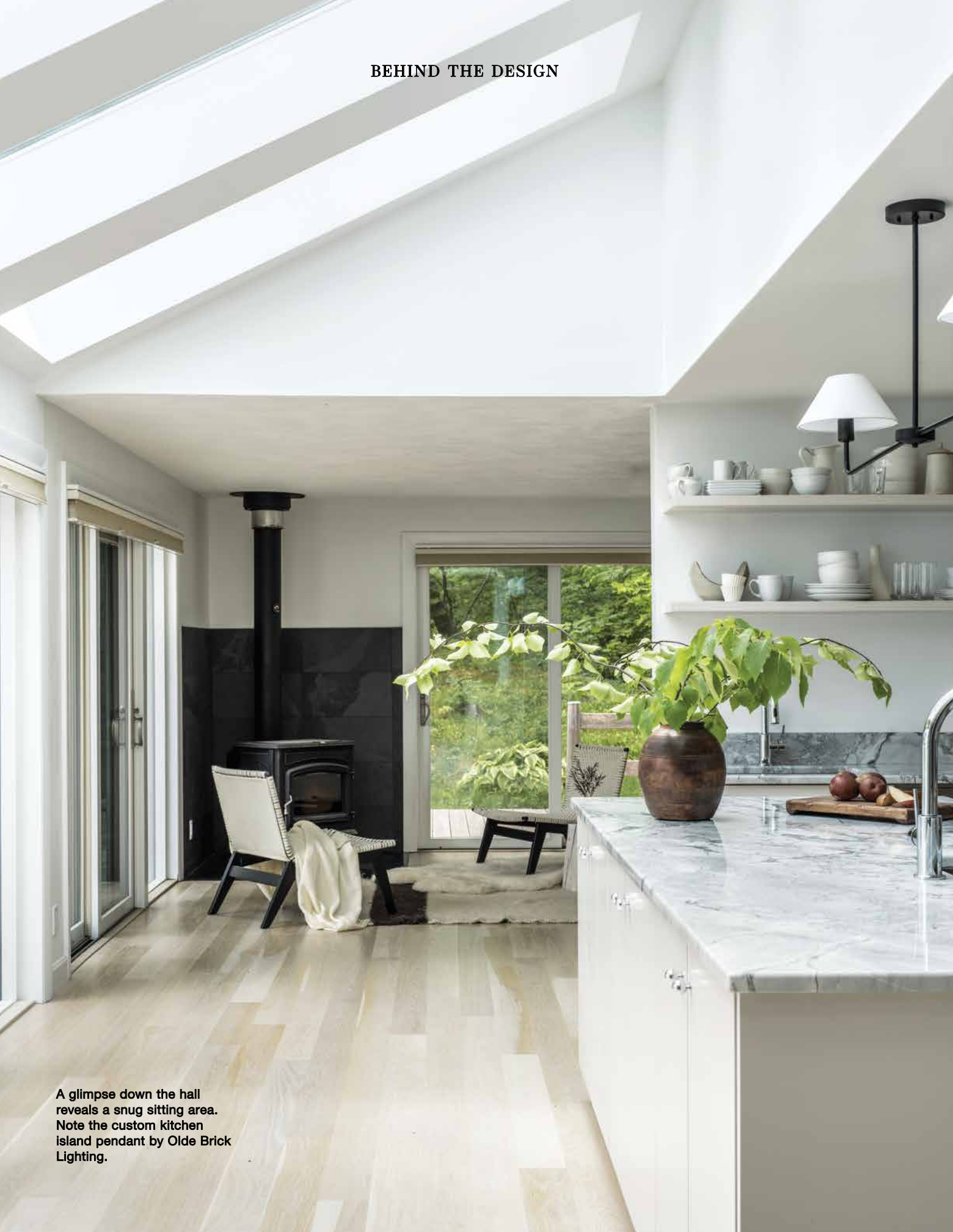
A glimpse down the hall reveals a snug sitting area. Note the custom kitchen island pendant by Olde Brick Lighting.